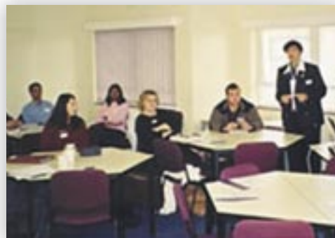
S Thomas conducting a Learning Programme Development Workshop